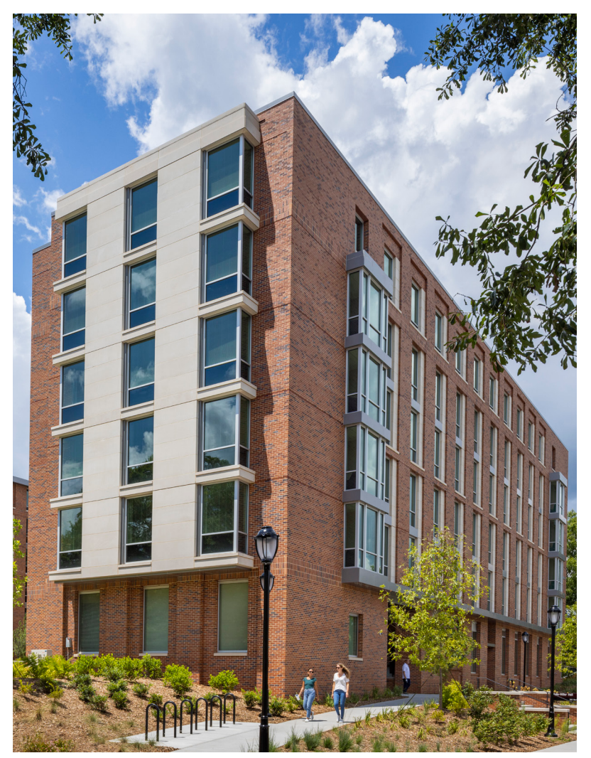
University of Georgia, Black-Diallo-Miller Hall Athens, Georgia