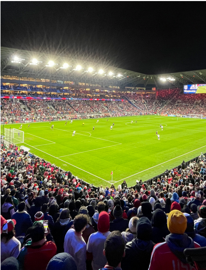
TQL Stadium for FC Cincinnati Cincinnati, Ohio