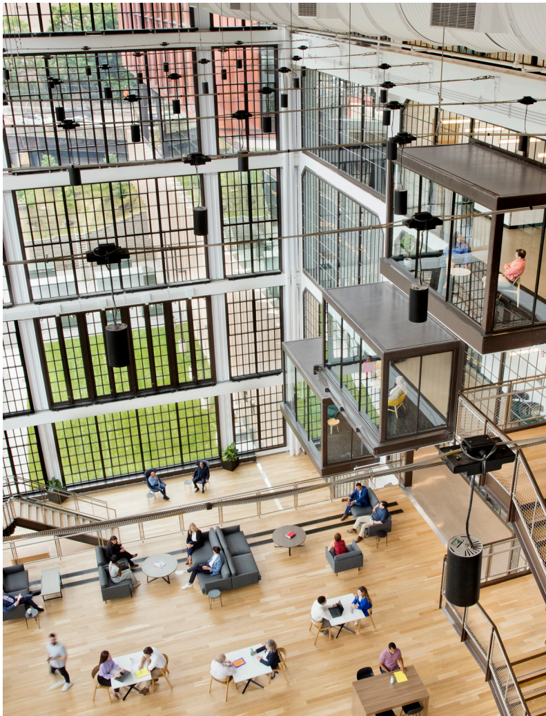
The Assembly Pittsburgh, Pennsylvania