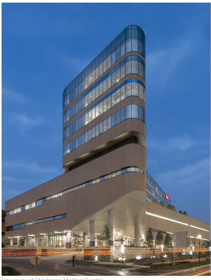
University of Oklahoma Medical Center Oklahoma City, Oklahoma