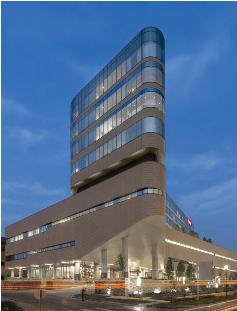
University of Oklahoma Medical Center Oklahoma City, Oklahoma