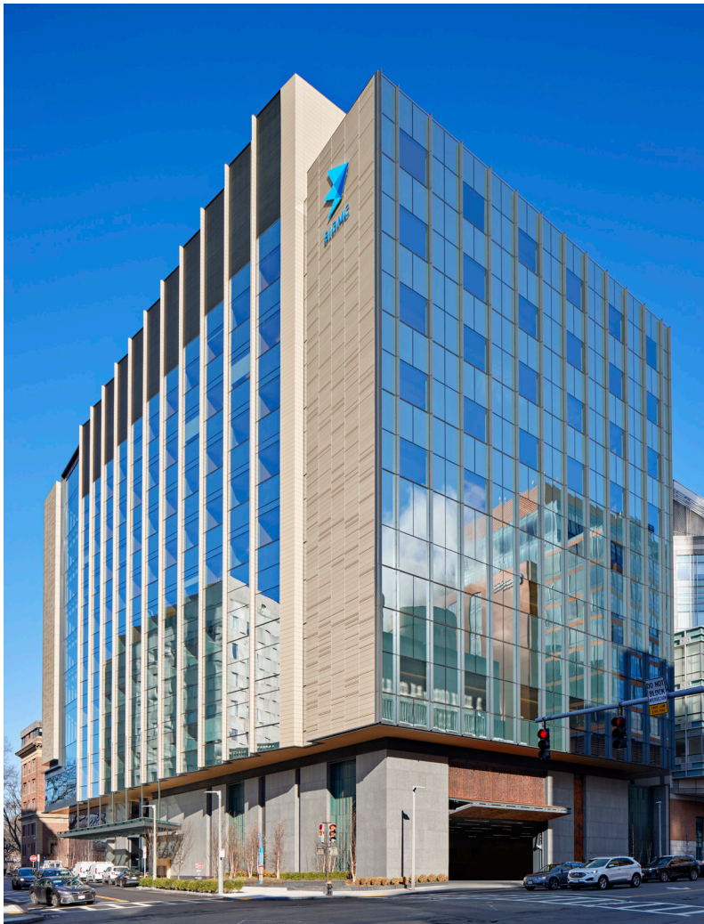
Beth Israel Deaconess Medical Center, The Klarman Inpatient Building Boston, Massachusetts