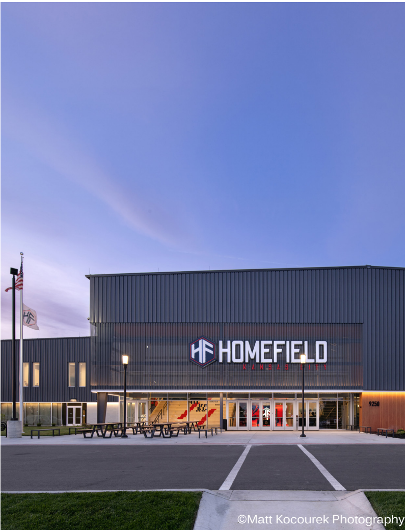
Homefield Kansas City Kansas Showcase Center Kansas City, Kansas

The Turner Building Cost Index is determined by the following factors considered on a nationwide basis: labor rates and productivity, material prices and the competitive condition of the marketplace.