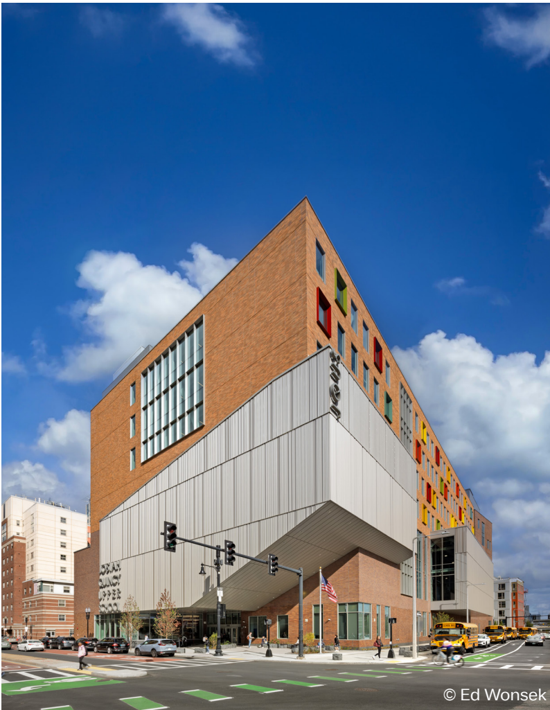
Josiah Quincy Upper School Boston, Massachusetts